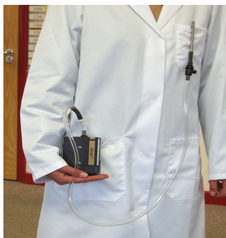
Fig 1. Pumped Sampling (Pump can be fitted to pocket or belt)

Passive or active (pumped) sampling can be selected using this type of tube. After exposure, the tube is analysed using Thermal Desorption / Gas Chromatography / Mass Spectroscopy techniques.